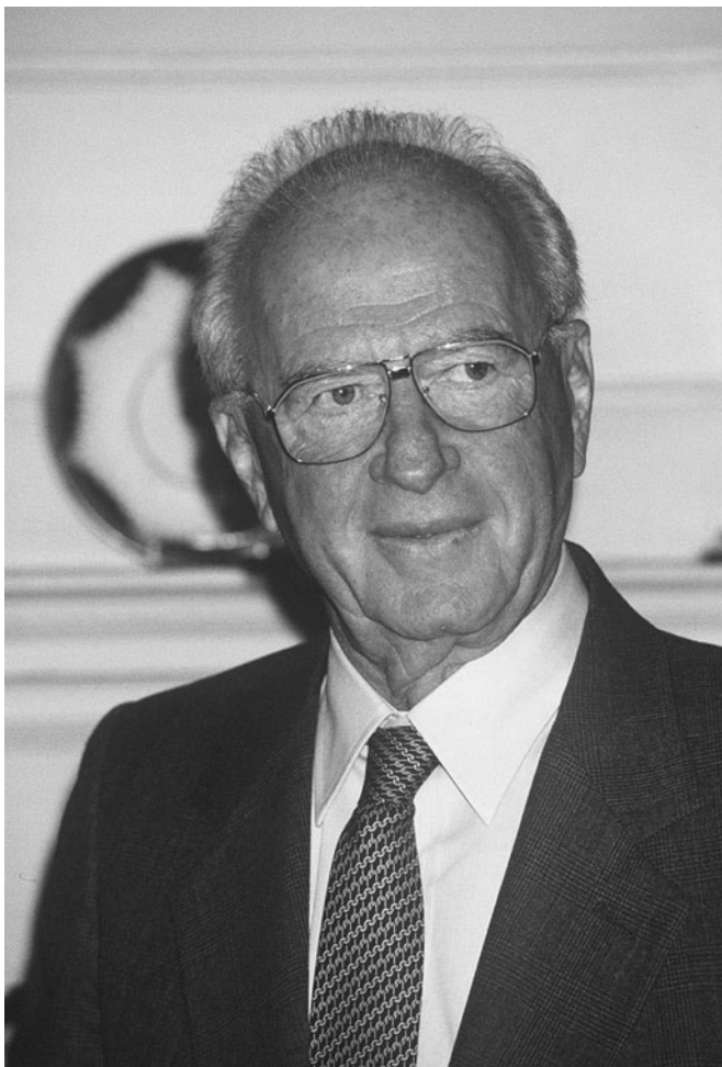
8. Israeli premier Yitzhak Rabin, 1994