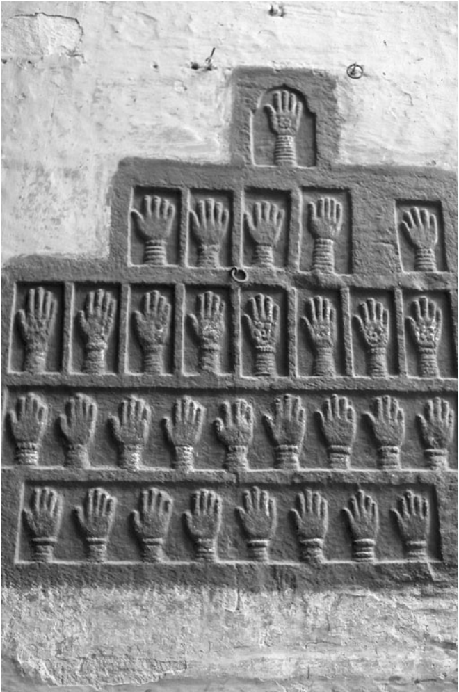
4. Sati stone showing the hands of women who sacrifice themselves