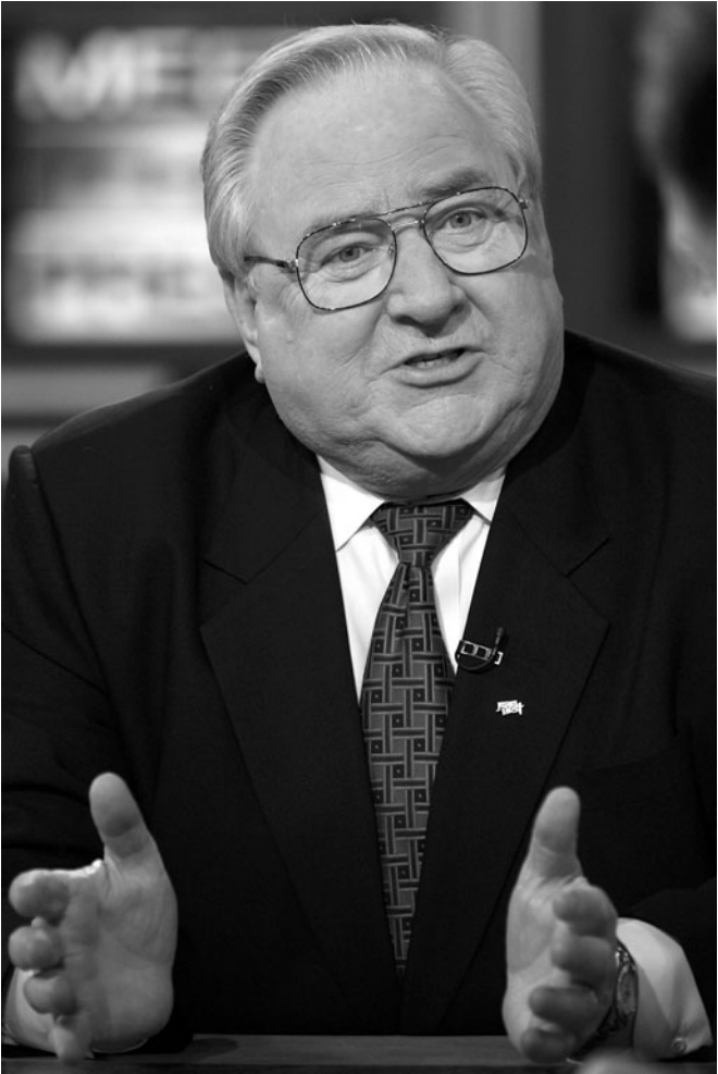
15. Jerry Falwell