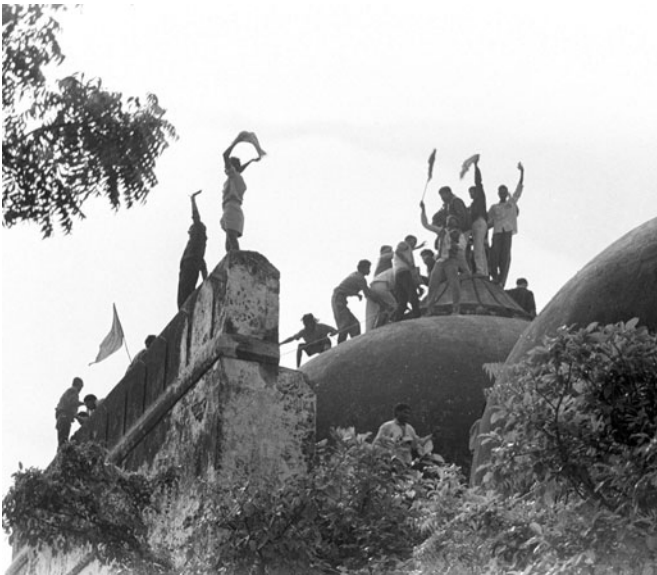
13. Destruction of the Babri Masjid, Ayodhya, India, December 1992

In an action that infuriated India's Muslims (and would have wide repercussions in Pakistan), the 13,000 police and militiamen who had been drafted to protect the site failed to intervene. The subsequent riots in Bombay and other cities were the worst since India's independence in 1947. In a series of pogroms, thousands of