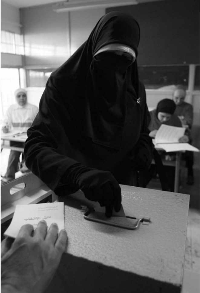
6. A veiled Muslim woman casting her vote