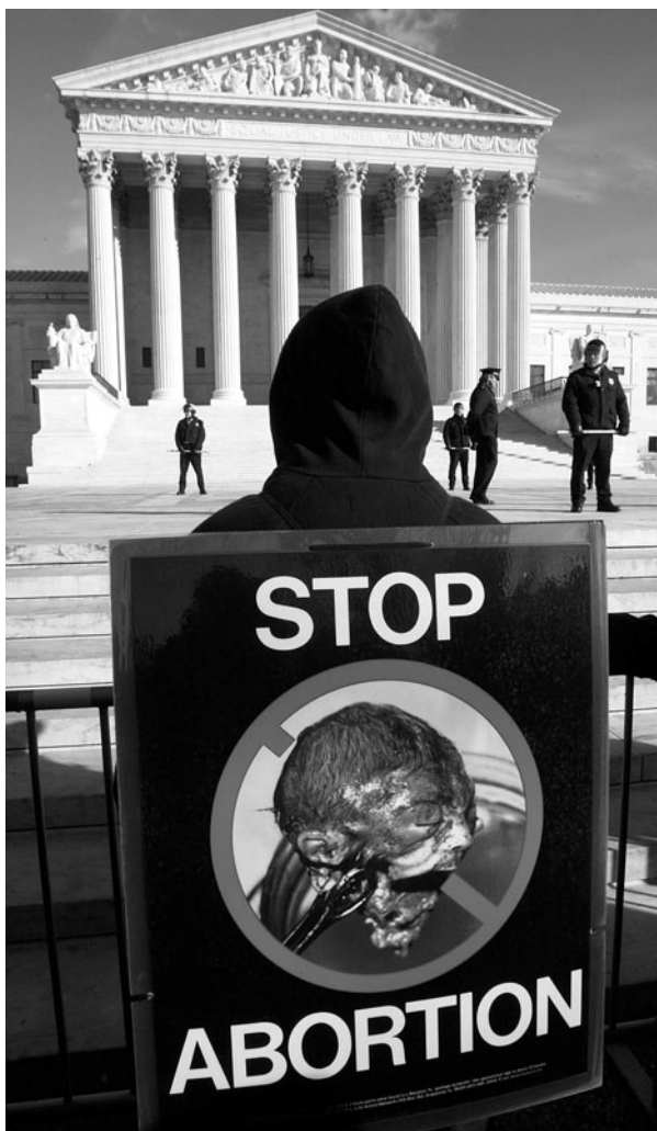
3. An anti-abortion demonstration outside the US Supreme Court