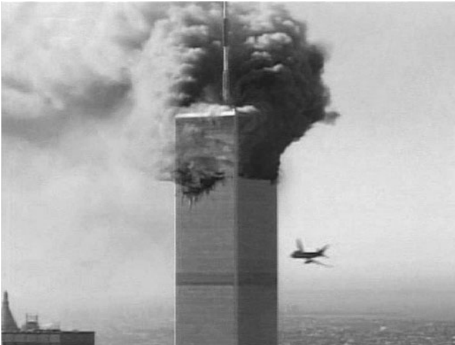
1. The World Trade Center, 9/11