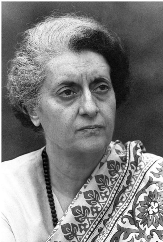
12. Indira Gandhi