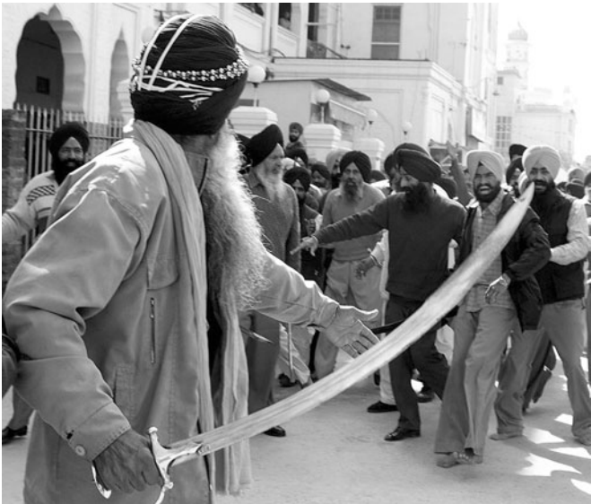
11. Bhindranwale (pointing) confronts Sikh guards at the Golden Temple