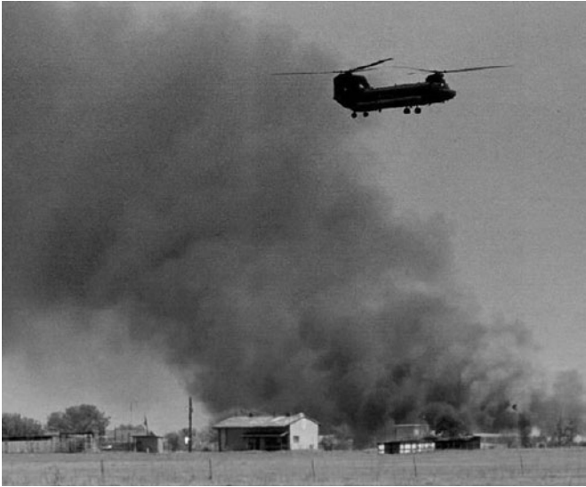
14. Storming the Branch Davidian compound, Waco, Texas, 1982