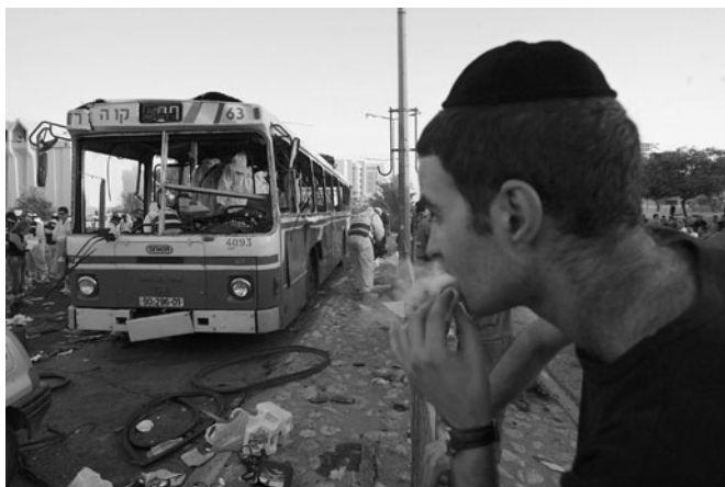
16. The remains of an Israeli bus after a suicide bombing

Fundamentalism As numerous media theorists have pointed out, television is not the same as propaganda. It does not have a unidirectional or homogenizing impact on viewers. Most viewers bring pre-existing knowledge to what they see and hear on television, decoding images according to their prejudices. In the Muslim world, images of Israeli oppression may be reinforced by perceived differences in lifestyles. For example, the explicit sexual interactions to be seen on a Tel Aviv beach may add to Islamist perceptions that Palestinians are facing not just a racist enemy that discriminates against them, but one that is wholly evil because of its pagan ( jahili ) social attitudes. Secondly, as explained already, fundamentalists benefit from the para-personal, electronically amplified relationships between charismatic leaders and their audiences. Nasser and Hitler were both beneficiaries of the new medium of radio; both Khomeini and bin Laden seem to be iconically impressive figures able to convey the solemnity, gravitas, nobility, and asceticism Muslims associate with the aniconic image of the Prophet Muhammad.